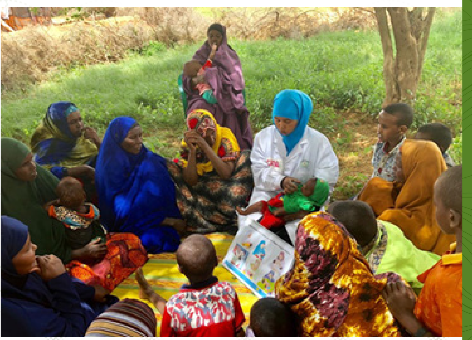
Nutrition sessions with mothers

4009 males and 5157 females received hygiene and sanitation and nutrition awareness raising. 250 households (HHs) were provided with hand washing soaps.