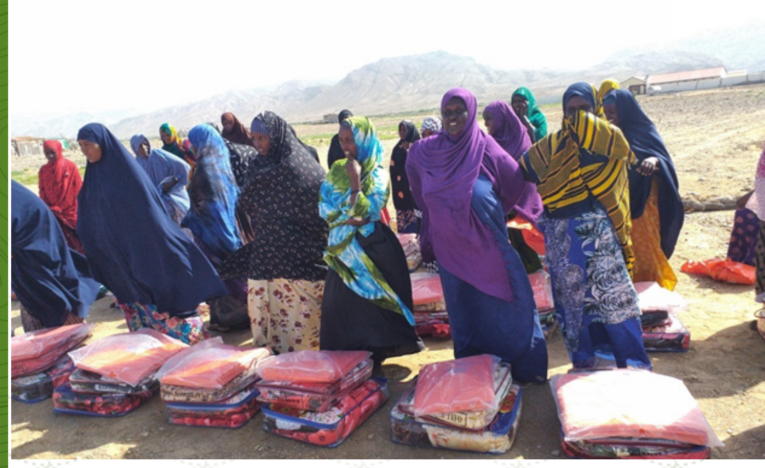
Distribution of NFI blankets and temporary shelters to the coastline villages Xiis and Laasosurud.