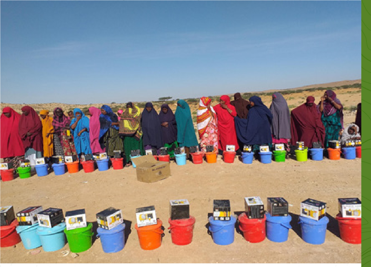
Distribution of dignity kits to women in Eastern Somaliland