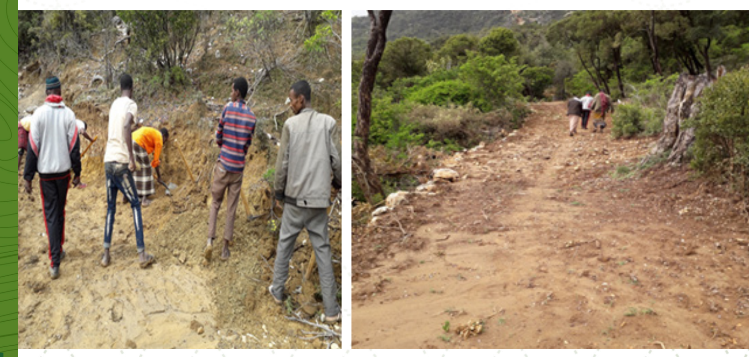
Left: A road under rehabilitation through Cash for Work in Sanaag region. Right Finished road

The members are encouraged to save together and take out small loans from these savings