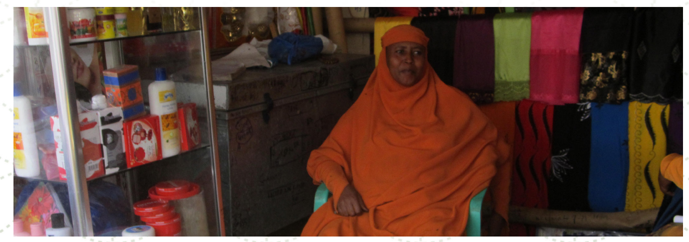
Business created by SHG members

SHG approach has led to an improvement of socio-economic development of the poorest section in the community, It has changed family lives and it has progressed involvement in community action, it is Increased communication level of members, Self confidence among members, social harmony, Social Support/Capital; also the approach reduced the conflict among the community and the community members can claim their rights.