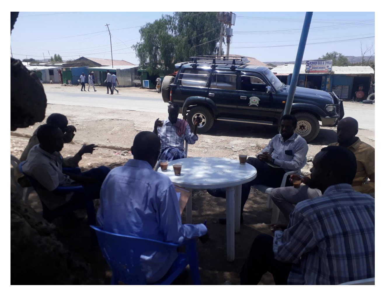
Figure 1: FGD in Sheikh