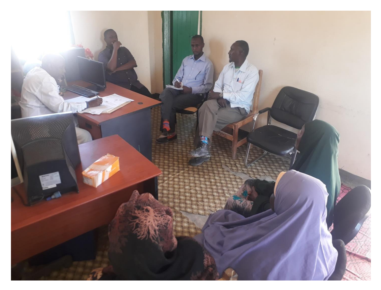
Figure 3: FGD in Odweine