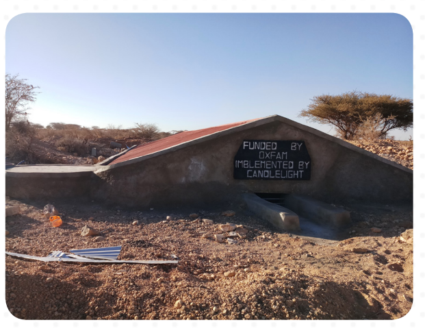
Left: A finished shallow well in Balanbaal Right: A finished berkerd in Ardag village