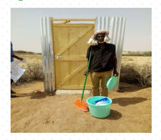
New latrine with cleaning tools, Yirowe