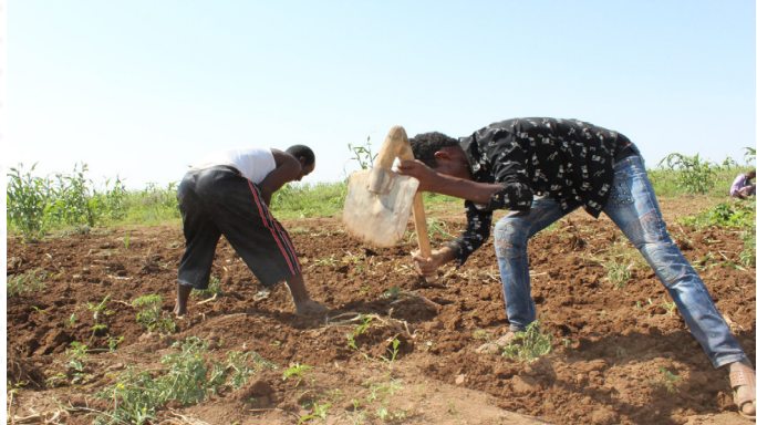
Left: Post harvesting of cereal crops, a farmer packaging his production and Right: Land Preparation on a demonstration farm to train local farmers in Magaalo-cad, Awdal region