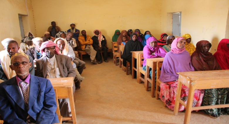
Left: Rural youth and Right: parents attend training on FGM/C and its negative consequences