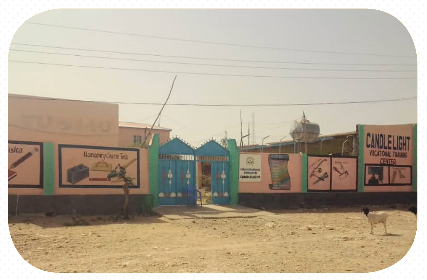
Candlelight vocational training center in Hargeisa

Candlelight also has a strong working relationship with community leaders/ elders who play a key role in the design and implementation of education projects. Several Local and International NGOs and UN agencies have enabled Candlelight to implement educational projects; providing financial, material and technical support.