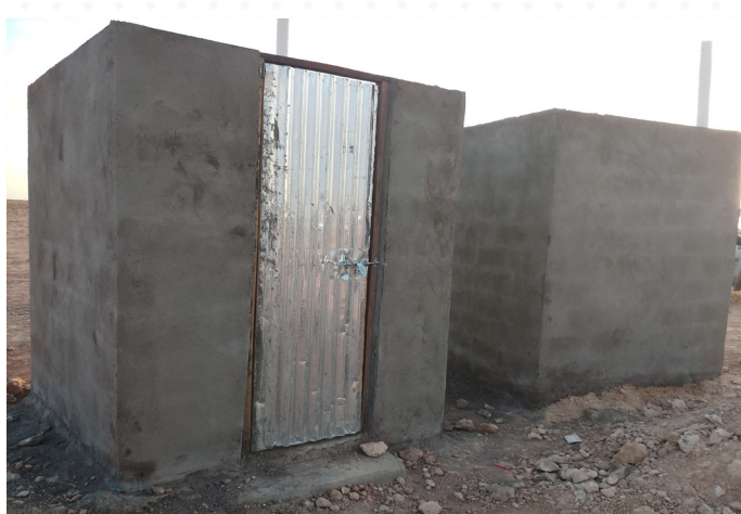
Emergency pit latrines in Sabawanaag village