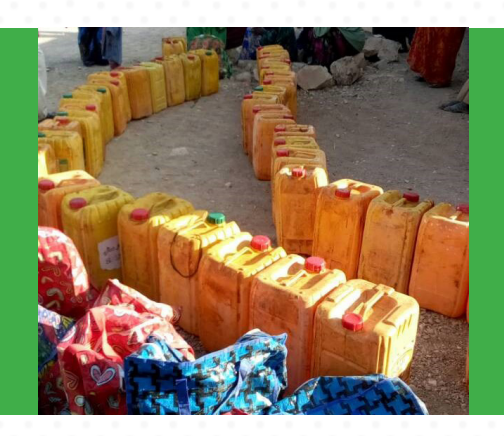
Jerricans which are part of the hygiene kits assembled for distribution

of CHMs who also demonstrated how to use the tablets to improve water quality.