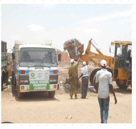
Mass cleaning campaing, Saylada, Burao