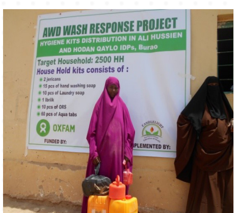
Hygiene kits distribution