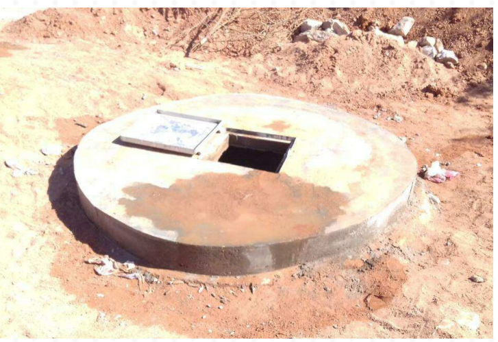
Left: Beneficiary colleting water, from a water kiosk in Ali Hussein and Right: Finished shallow well in Odwein