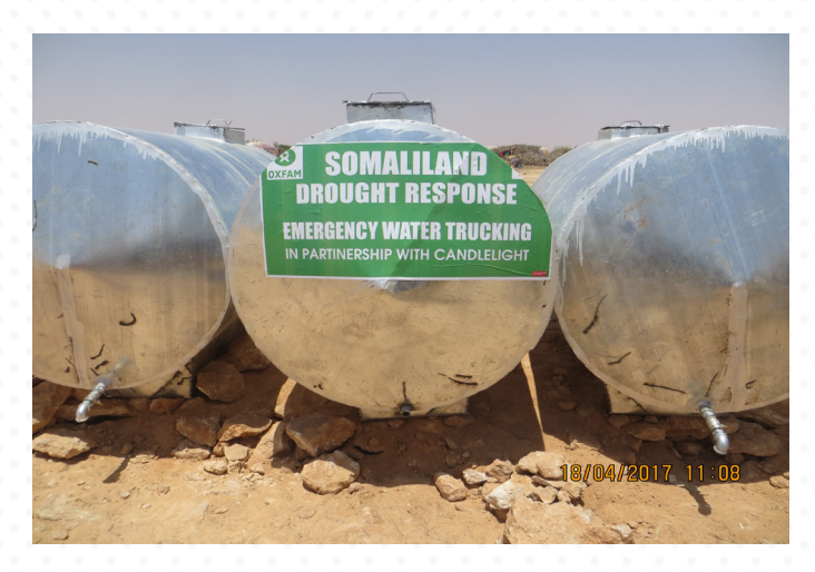
Water tanks installed in Sabawanaag village

of Dhuurmadarre, Laasdomare, Siga-dher and in Xamilka. The water tanks were fitted with kiosks for ease of drawing water from the tanks.