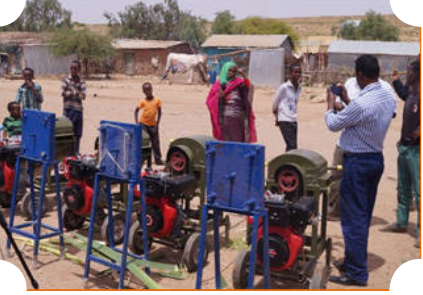
Farm tillage support, sisal nursery, women displaying their sisal products, sisal decorticators.