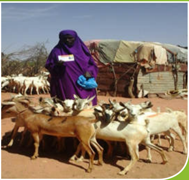
Distribution of female gotas to target beneficiaries