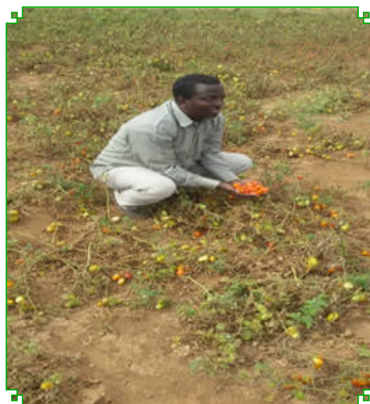
Income diversification: vegetable production