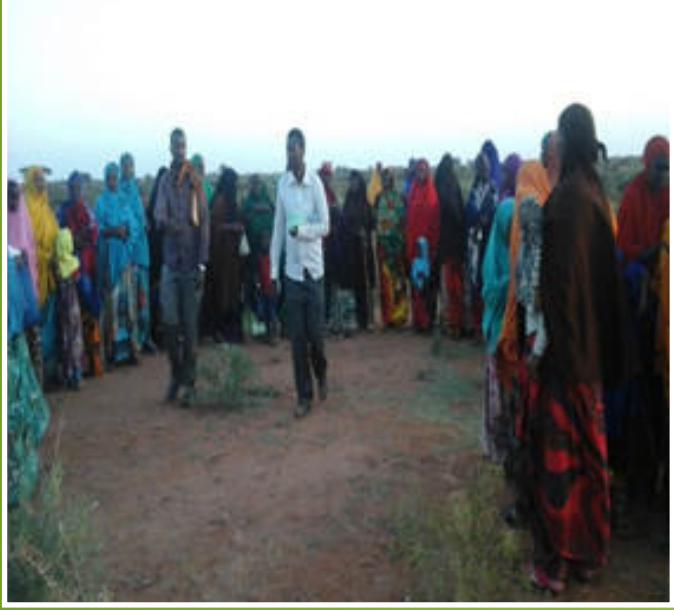
Selection of beneficiaries for livestock re-stocking support