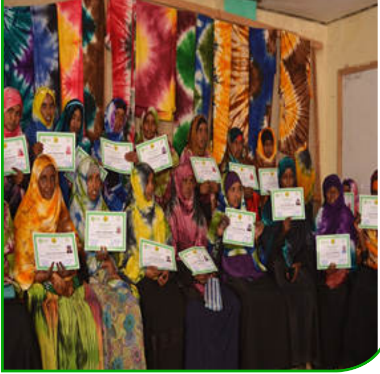
Beekeeping training and, tie and dye cloth making