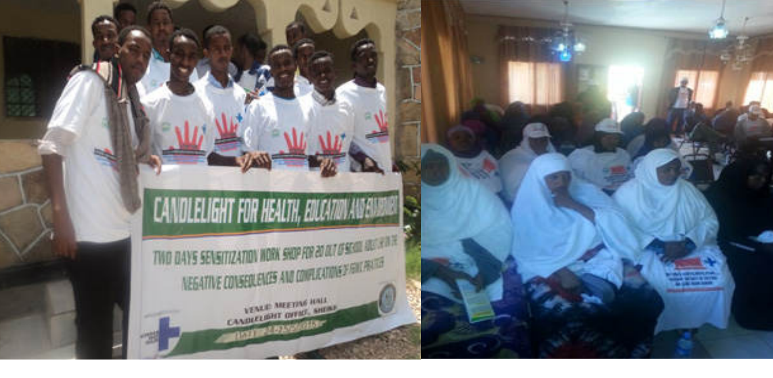
FGM/C training and sensitization held for the youth in Burao