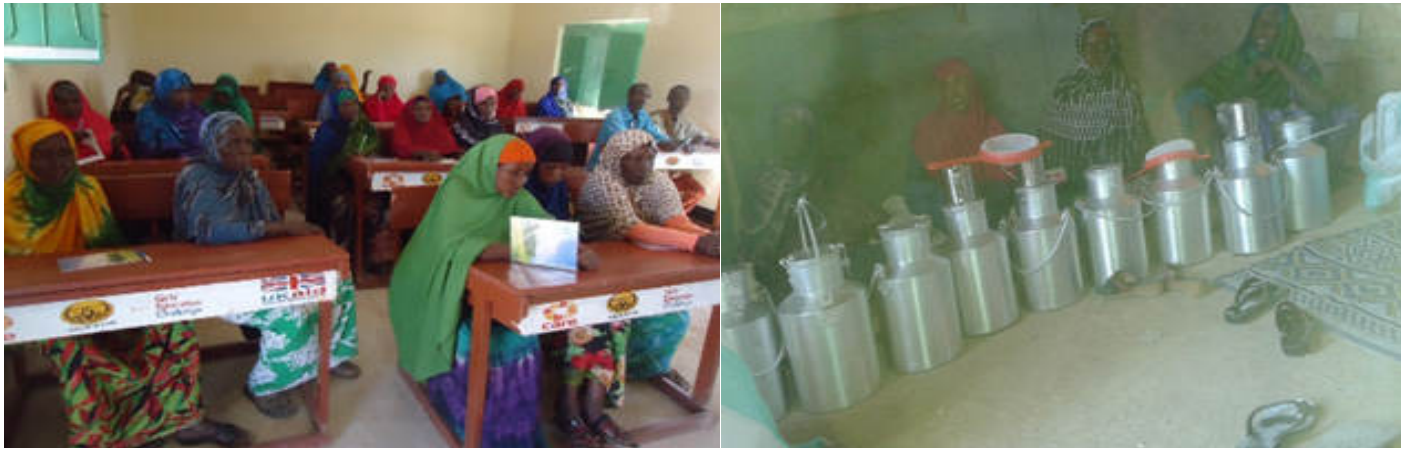
Women training on literacy and numeracy and Training women on milk preservation, distribution of milk jugs

In addition, the project addressed environmental degradation by supporting project participants practicing charcoal production to pursue other alternative livelihoods as well as engage in construction of check dams, which have positive impact on regeneration of grazing lands areas.