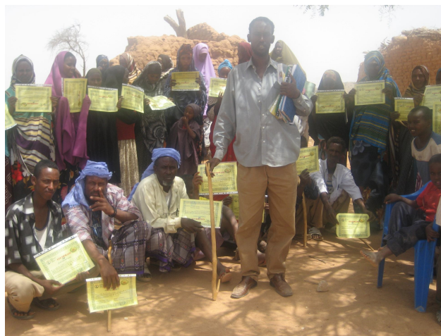
Literacy and numeracy training

In collaboration with CARE International and Education Development Centre (EDC) , a Somaliland Youth Empowerment Project aimed at improving the standard of living of the youth and their families through access to self-employment opportunities for urban and pre-urban poor youth in Hargeisa was implemented in Hargeisa. The specific objectives were: