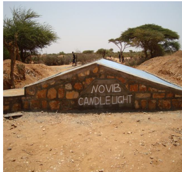
Rehabilitated Berkads in Sanaag and Togdheer regions

Organizations that supported the above projects are: CARE International, Oxfam Novib, and Development Fund (Norway).