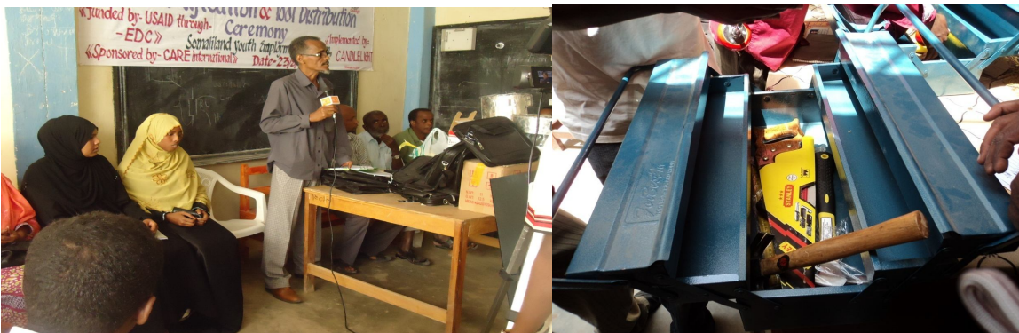
Tools and safety materials distributed at Burao vocational training center

Burao Vocational Training Centre (BVTC) , established in 1998 is one of the most important educational/training institutions in Burao town. During the year, hundreds of youth have been training with marketable skills including electronics, secretarial skills, tailoring, cookery and nutrition, henna decoration and non-formal education. The Centre also accommodates for formal education for both boys and girls.