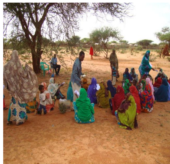
Hygiene and sanitation awareness in progress