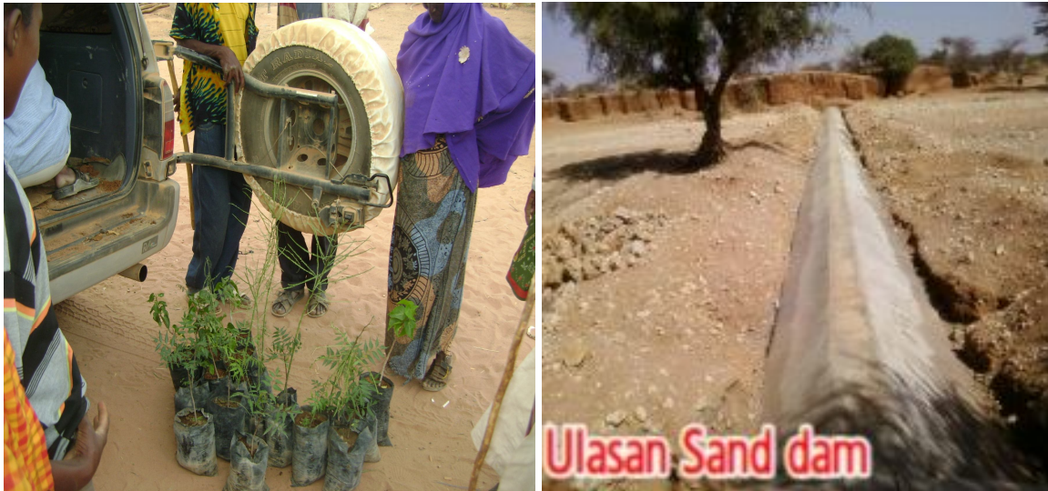
Distribution of seedlings to villagers (left); completed sand storage dam (right)