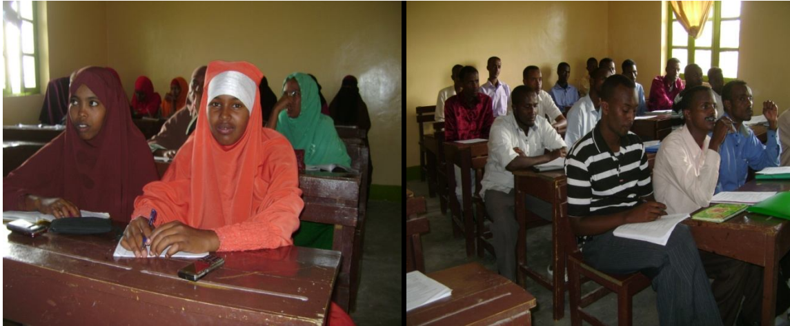
Youth trainees in the classes at candlelight youth development centre ( Hargeisa)

Towards the end of the year, CLHE partnered with the African Development Fund (USADF) whereby CLHE will implement a skills acquisition and job placement project for 240 youth of both sexes with ages ranging between 18-35 with job skills training as a means of increasing their chances of employment and/or self-employment. The project location was in Hargeisa.