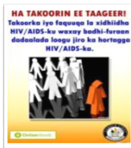
Some of the Information, education & communication (IEC) materials produced during the year

For over a decade now, CLHE has been carrying out interventions in community education on the dangers of female genital mutilation/cutting (FGM/C) in some parts of Somaliland. In 2011, the activities in this component concentrated in Burao and Erigavo with funding from the International Solidarity Foundation of Finland .