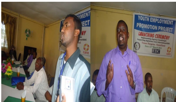
Graduation ceremony of youth employment training