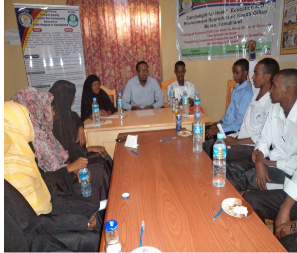
Trained traditional birth attendants with kits (left), a focus group discussion on FGM in progress (right)