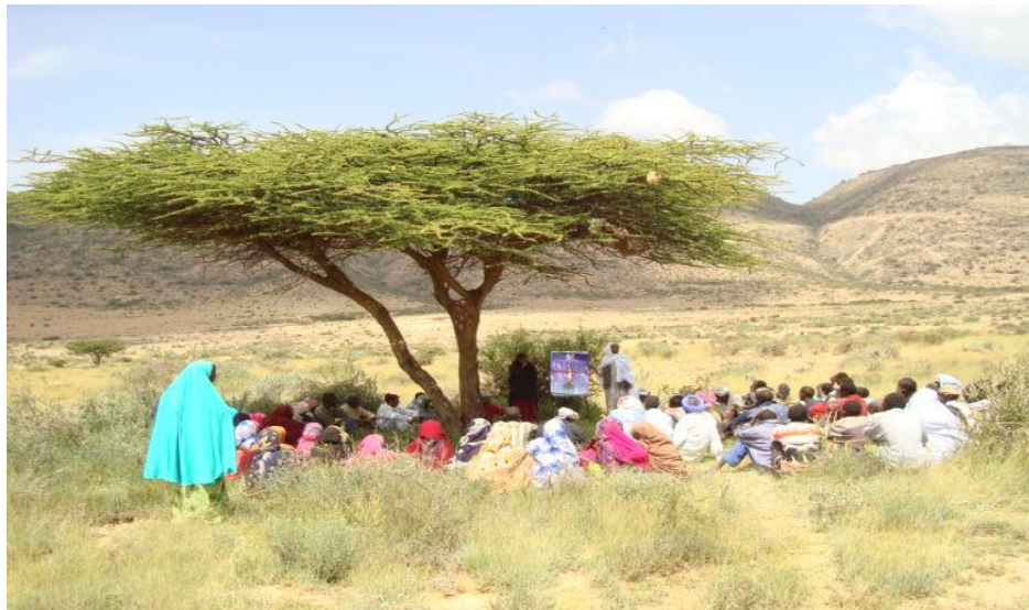
Photo#1 Hygiene and sanitation awareness in progress Wadayax settlement near Erigavo of Sanaag Region

The hygiene and sanitation awareness is a packaged with water projects carried out by the organization. During the year, CLHE carried out a number of water projects which benefited rural communities in an effort to mitigate the effects of water shortage. These included rehabilitation of Berkads (in-ground cemented water tanks) and man-made surface water catchments ( Ballehs ) in the drought-borne areas in Sanaag, Togdheer and Maroodi Jeex regions. CHAST (Children's Hygiene and Sanitation Training) and PHAST (participatory hygiene and sanitation training) methodologies were used in all the project sites as a tool for behavioural change and in order to contribute to the sound hygiene and sanitation practices among children and at the same time empower the communities to manage their water and to control sanitation-related diseases.