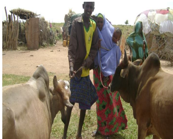
Photo # 4 (left) a rehabilitated Berkad in Dararweyne, Sanaag region Photo # 5 (right) Distribution of Oxen for farm tillage among farming communities in Galooley

Organizations that supported the above projects are: CARE International, Oxfam Novib, UN/OCHA and Development Fund (Norway).