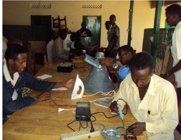
Photos 6 & 7 (above): Electricity and electronics trainees in Burao