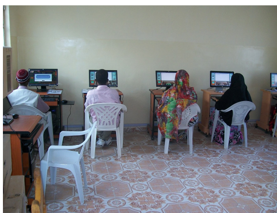
Photo 13 & 14: a tailoring class and a computer lab in CLYDC in Mooge suburb area, Hargeisa

Integrated Qur'anic School Pilot Project: In Partnership with UNICEF, Ministry of Religious Affairs and Endowment and the Ministry of Education, this pilot project aims at improving the physical environment as well as making Qur'anic schools "Child Friendly Learning Spaces". The inputs include improved pedagogic skills, expansion and/or physical rehabilitation of the schools and capacity building for concerned government authorities. Four schools with an estimated population of 300 children (40% girls) in Saaxil and Maroodi Jeex were selected for this intervention. During the year, selected 8 Qur'anic schools were constructed and their capacity was improved through provision of basic support in pedagogic skills and teacher trainings, text book.