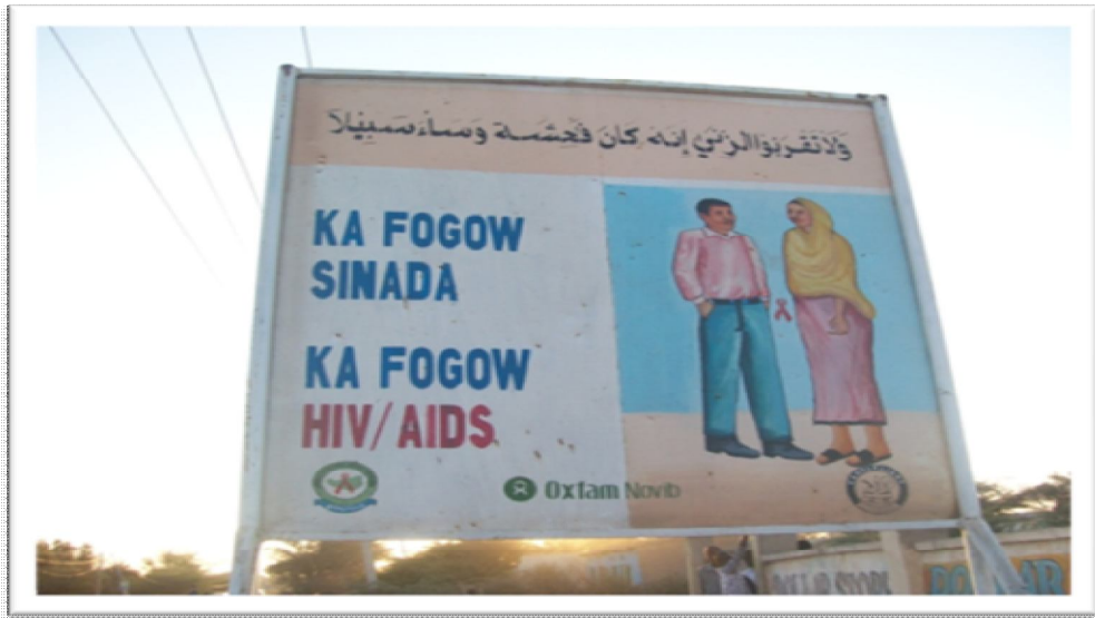
Photo #2: An HIV/AIDS poster in Hargeisa town carrying a public message

The two year long project is aimed to realize the following outcomes: