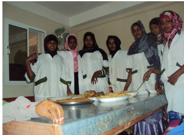
Photo. 8 & 9: Secondary school class in BVTC (left). A cookery class (left)