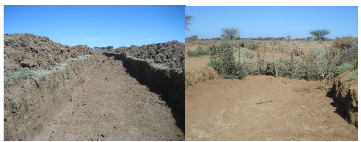
Rehabilitation of an irrigation Canal in Galoolay village and lining vegetation barriers to heal gullies.

With the specific objectives of decreasing community vulnerability to climatic shocks and at the same time enhancing their food security, a number of activities have been carried out in different parts of the country. Here are some examples. Since this project has made a huge impact on the environment preservation it deserves to enrich the information as well as pictures;