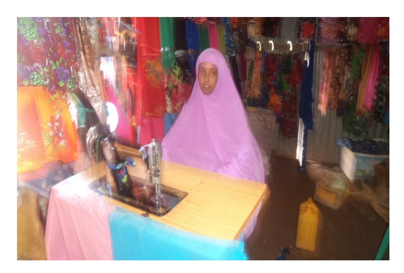
Figure 1 Halimo Sitting inside of her shop

Roda Dahir (28 years) is divorcee with 5 children, residing Balli obsiiye village in Togdheer region. She is one of community members who indirectly benefited from the above project. By establishing a small kiosk near the project site, she used to prepare and sell tea and food to the casual labourers who worked in the rehabilitation of a surface water catchment (Balleh) in the village through cash for work (CFW). Roda's bush restaurant is an example of how CFW can play an important role in reviving livelihoods and invigorating local businesses.