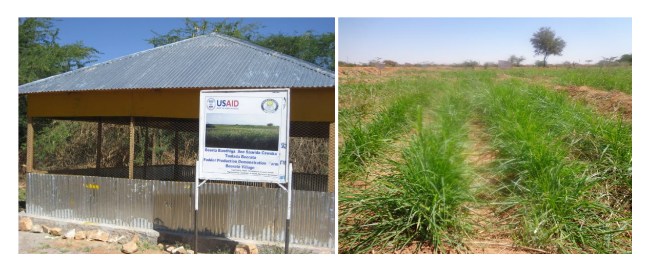
Sample fodder storage shed and fodder demo farm. (Photos are from a project funded by USAID through DAI – Partnership for Economic Growth.

In an effort to promote community based fodder production, storage and handling, CLHE carried out pilot activities in Togdheer and Sahil region. During the project period, demonstration sites for the production of fodder and storage sheds were established. The project also introduced baling techniques and training on best practices in fodder production. This project has a lot to positive information to share with our stakeholders. Under this project we have carried out significant # of important activities which we could like to use as publicity;