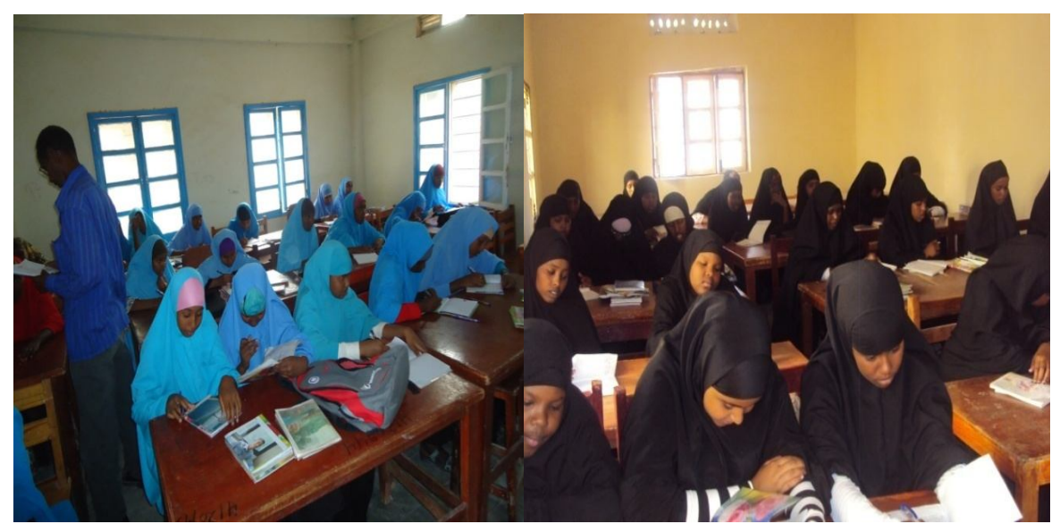
Formal education run by CLHE in Burao