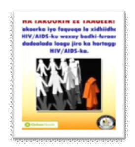
IEC Material for posting in offices, schools and health centres

For over a decade now, CLHE has been carrying out interventions in community education on the dangers of female genital mutilation/cutting (FGM/C). During 2012, the two agencies which supported CLHE in the eradication of FGM/C are International Solidarity Foundation of Finland and Kinder Not Hilfe (KNH) Germany. While FGM/C and other voilence against women (VAW) components are mainstreamed in the different projects, specific activities on FGM/C were carried out by Candlelight in Burao, Erigavo and Sheikh towns. The main activities carried out during the year include targeted sensitization of healthcare providers, training of traditional birth attendants, community education committees, parents, peer to peer groups, teachers and religious leaders and counselling of FGM/C victims.