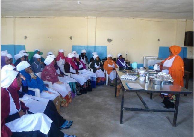
Graduation ceremony for Cookery trainees