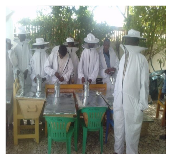
Livelihoods project in Erigavo with focus on IDPs: Provision of poultry and training on Beekeeping (Funded by Kirkonulkomaanapu (FCA)