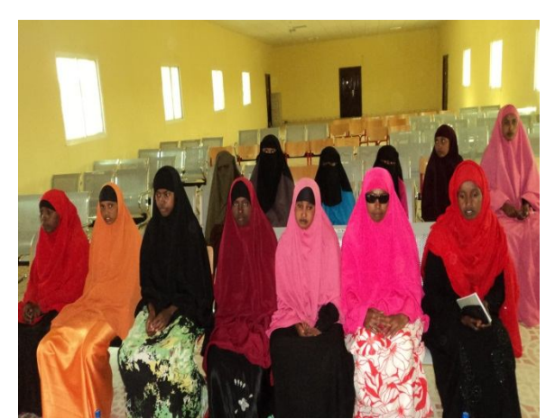
Peer to Peer group in Sheikh town