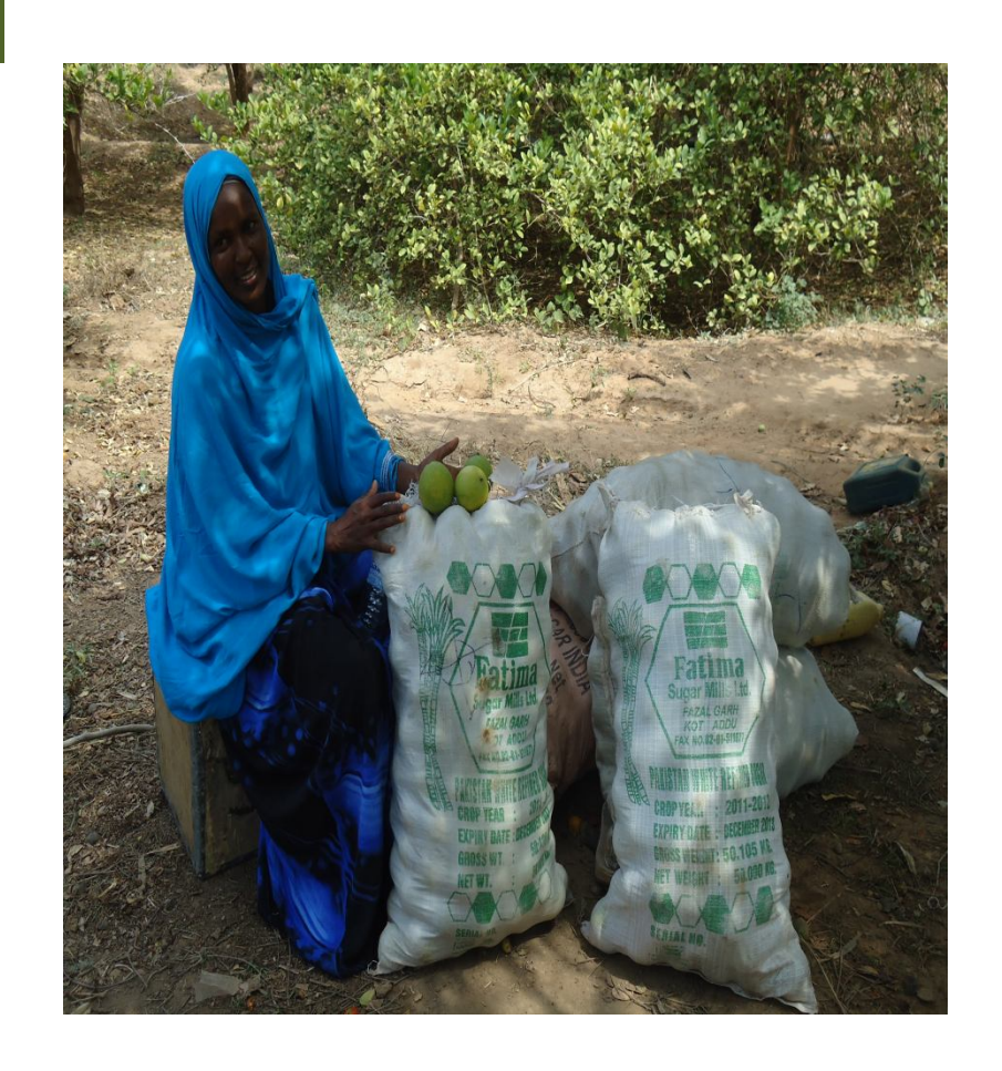
Candlelight for Health, Education & Environment (CLHE)