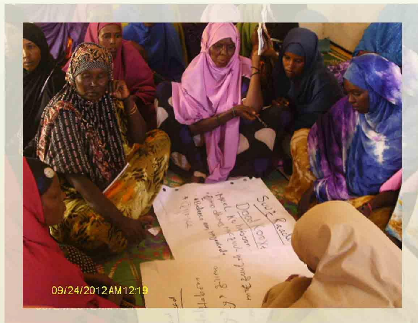
Training on business skills and establishing Village Savings and Loan Associations in Dhagax dheer villages, Togdheer.