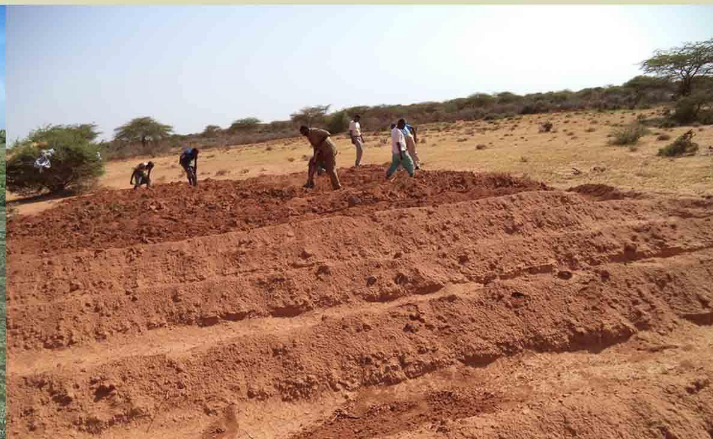
Soil and water conservation programme, Ga'anlibah and Baligudable, Salaxlay