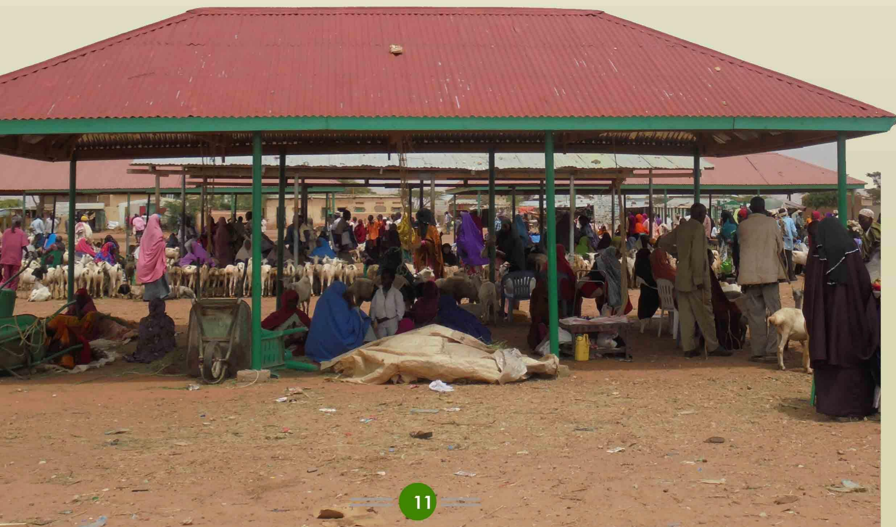
Construction of market structure in Burao, Togdheer Region