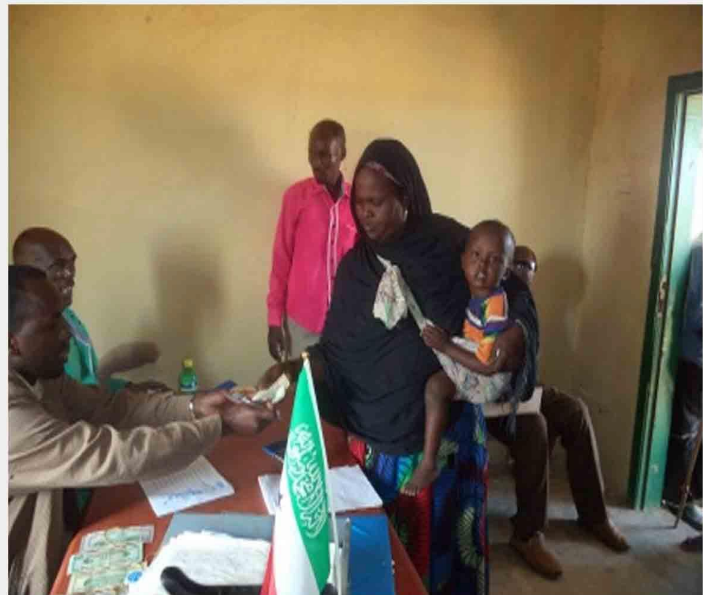
Unconditional cash relief programme in Awdal region