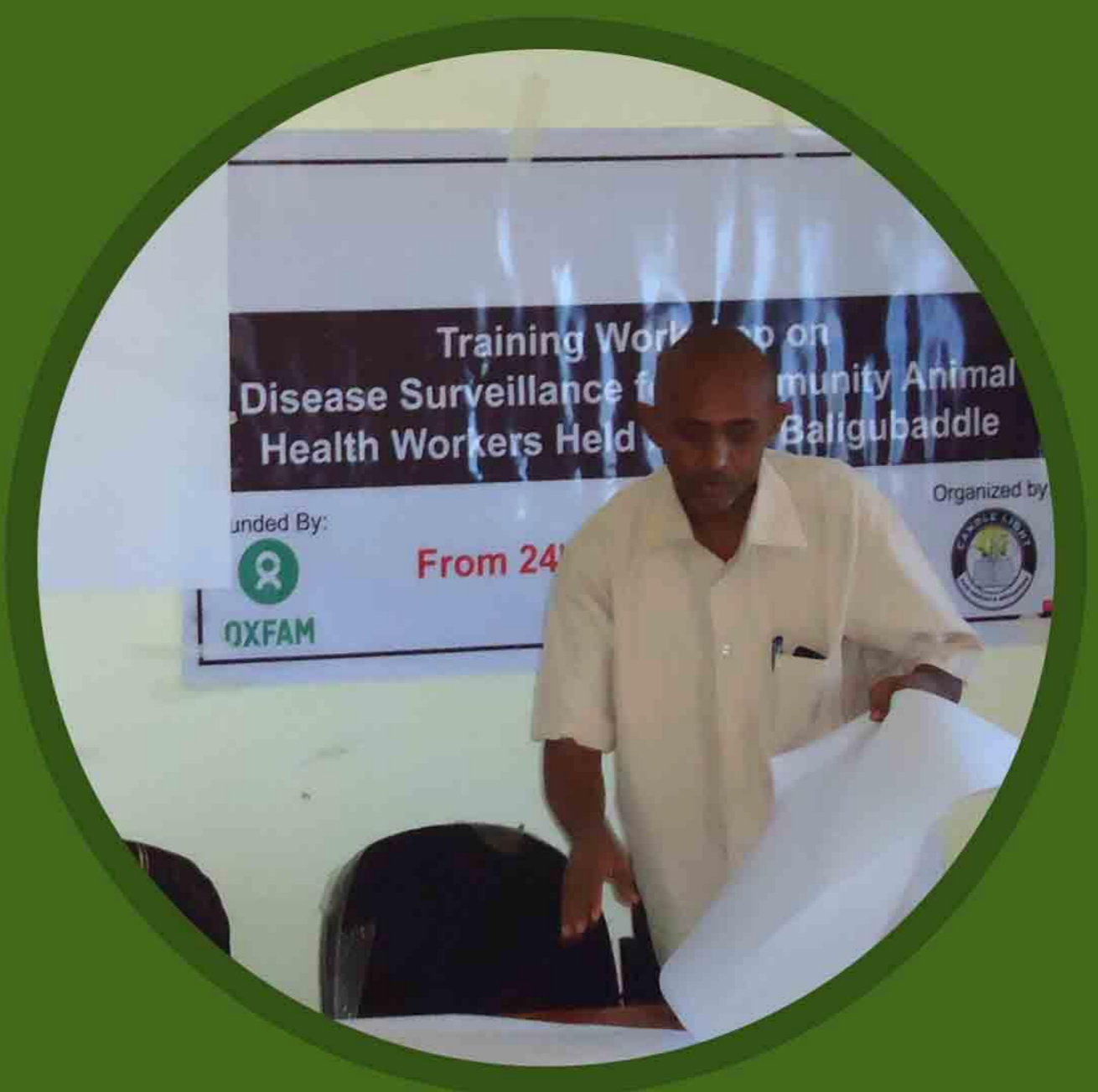
Training for Community Animal Health Workers Baligubadle