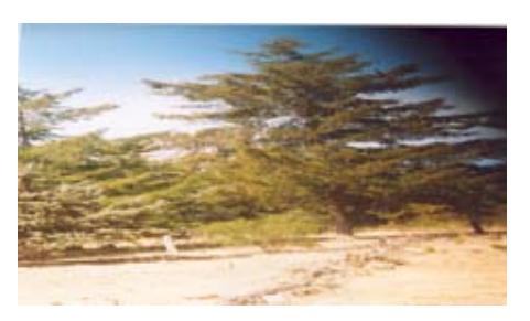
Fig. 12: Cypressus spp. introduced to Daallo mountain during the British colonial period are still thriving – despite of logging activities