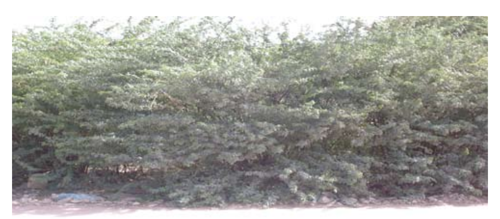
Fig. 19. A honey mesquite (Prosopis Juliflora) bush crowding an alley in Hargeysa