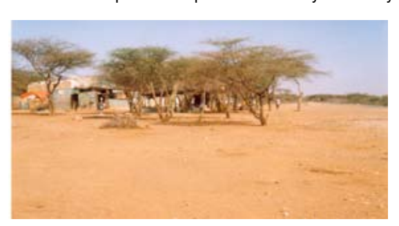
Fig. 7: Village in the Haud red soil. With the exception of few dying acacia trees, the areas is denuded of cover (trees, shrubs and grasses)

The need for special comprehensive study on this system is extremely urgent and justifiable.