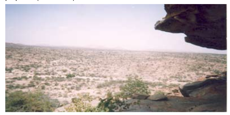
Fig. 2: Highly degraded coastal area below the catchment of Casha Madow (Black Mountain) towards Bullaxaar.

foetida in saline areas. The coastal zone itself includes Balanites aegyptiaca in the tree layer and grasses such as lasiurus hirsutus (' Darif '), Panicum turgidum (' Dungaare '), Eleusine , Eragrostis and Tragus ³. The pressure on this zone has increased when Haud, Nugaal grassland plains in the south has deteriorated and traditional routes of grazing has drastically been hampered by the parceling of communal land for private purposes (enclosures)