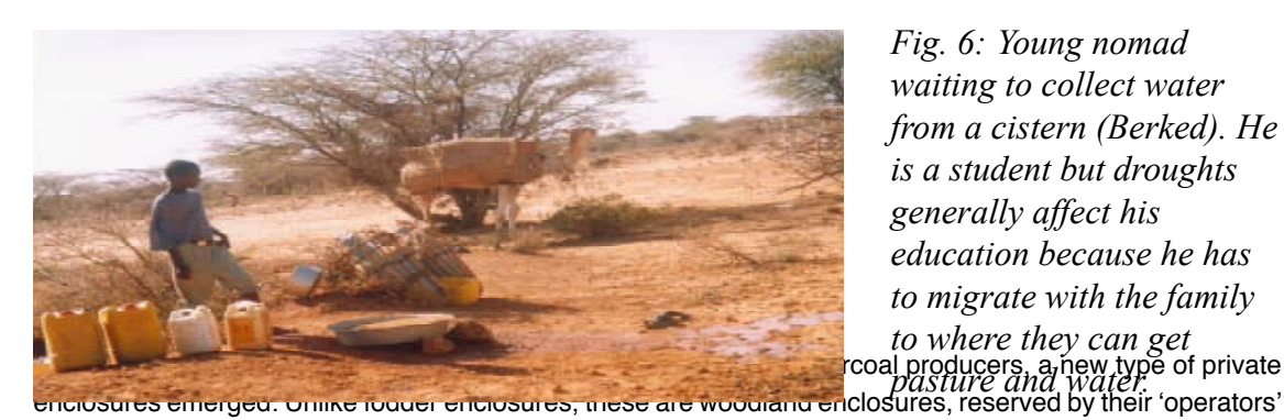
Fig. 6: Young nomad waiting to collect water from a cistern (Berked). He is a student but droughts generally affect his education because he has to migrate with the family to where they can get

Nomadic stock herding can sustain the life of a family as long as there is sufficient grazing and a good number of livestock to herd and the required number and calibre of manpower to do the herding. When either of those drops below a critical level, the family can no longer depend on this mode of life. They have to abandon and seek some other form of lifestyle. They would then flock to the urban centres. However this is not the sole factor that makes them drift to the cities. Love of individual liberty and a crop failure also leads to the same situation. Pastoralist intending to take their children to schools but unable to maintain them in the town also turn to enclosures. Pastoralists far enough from towns in areas where school facilities are unavailable may establish enclosures solely to attain a home from which the children can easily reach a town or a village school.