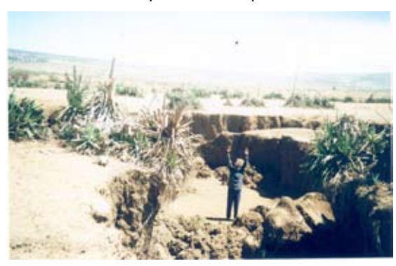
Fig. 3: Gully erosion threatening previous rehabilitation works done before the civil war. Bookh Valley, east of Gacan Libaax

b) Highland wood evergreen shrub: This zone covers from 4000ft – 7000ft. This zone is dominated by evergreen plants with usually the relict Juniperus procera (" Dayib "). Little remains of its kind in a strip of land along the ridge and inaccessible places of the range of Golis mountains. In view of serious erosion, overgrazing and cutting has reduced the vegetation cover and replaced with undesirable Dodonaea viscosa (' Heyramat '), Buxus hildebrandtii (" Dhosoq "), Acacia etbaica (' Sogsog '), Aloe, Euphorbia and Cadia . Also present are Sideroxylon buxifolium , Pistacia lentiscus and Dracaena ombet and common grasses such as Cynodon dactylon ('doomaar'), i, Eragrostis spp. , Pennisetum villosum , Themeda triandra ('daba shabeel') and Eleusine africana ('garagaro'). The main grass species in this zone is also dwindling. Gullies have spread and reaching the top. It is not uncommon to see the exposed root system of some of the species e.g. Acokanthera schimperi (" Waabey ") as a result of soil erosion The extensive erosion has lead Acacia etbaica to replace evergreen trees and shrubs and the micro-biological species left in the accessible cavities and niches within the top of the escarpments.