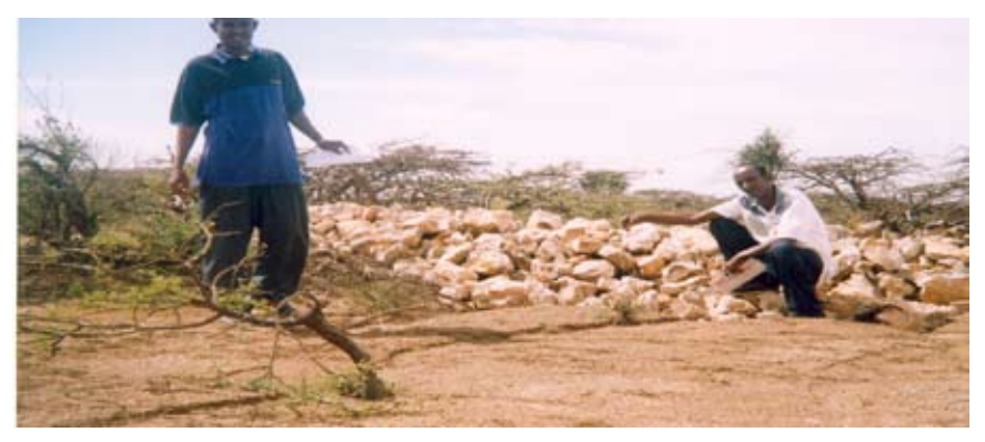
Fig. 20: Rehabilitation work in Gacan Libaax: Rockdams

As soil erosion is a major cause of the on-going environmental degradation, mainly resulting from deforestation, poor soil permeability, unsound cultivation practices in sloppy areas and with water retention structures destroyed and the loss of grass cover due to recurrent droughts and grazing pressure, it is recommended that a comprehensive watershed management programmes be carried out in the most affected fragile rain fed areas.