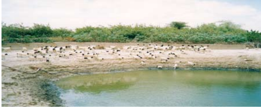
Fig, 5: One of the oldest surface water reservoirs (Ballehs) dug in Somaliland highly polluted and hence health wise risky.

The said earthen dams ( Balleys ) had lost their water storage capacities due to sedimentation processes and lack of maintenance during the years of civil strife in which farmers were either refugee or had no capacity to de-silt. The Berkads had also suffered a similar fate or have been intentionally destroyed by Government troops so that the Somali National Movement (SNM) militias or their civilian sympathizers will have a hard time reaching the main towns that were still in the hands of the Government during their trek from their bases in Eastern Ethiopia.