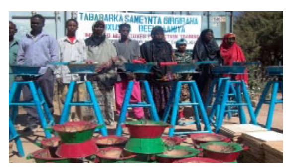
Figure 16: Training of artisans on the production of energy saving stoves

The major impact of the civil war is the alarming rate of reduction in the wooded areas of the country due to the increase of charcoal and firewood production that is attributed to the following:-