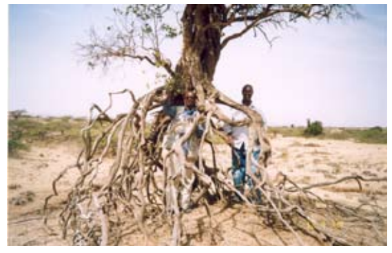
Fig. 4: Exposed root system of Acokanthera schimperi. Over 2m of soil is lost to water erosion. (Gacan Libaax)