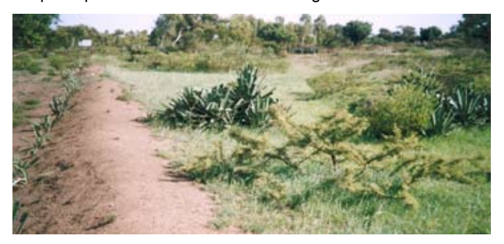
Fig. 22: Rehabilitation work in progress in Gacan Libaax – A Candlelight project