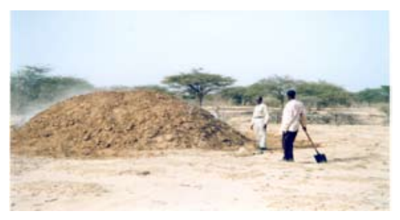
Fig. 15: Kilning process in progress