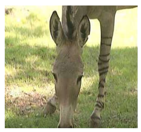
Fig. 17: Somali Wild Ass