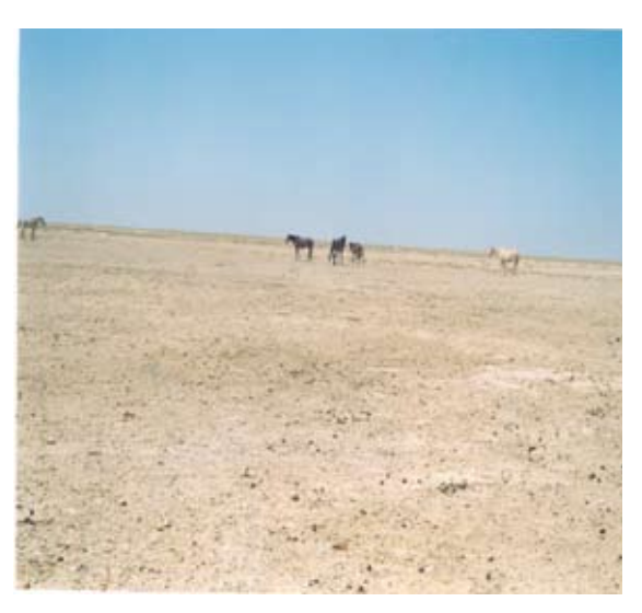
Fig. 18: A remnant herd of horses grazing Bancade plain, Sool

Candlelight -Impact of Civil War on Natural Resources – A Case Study for Somaliland