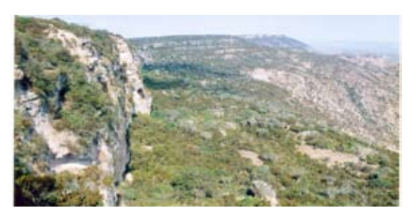
Fig. 11: Typical view of Montana forest at Gacan Libaax in Sahil Region